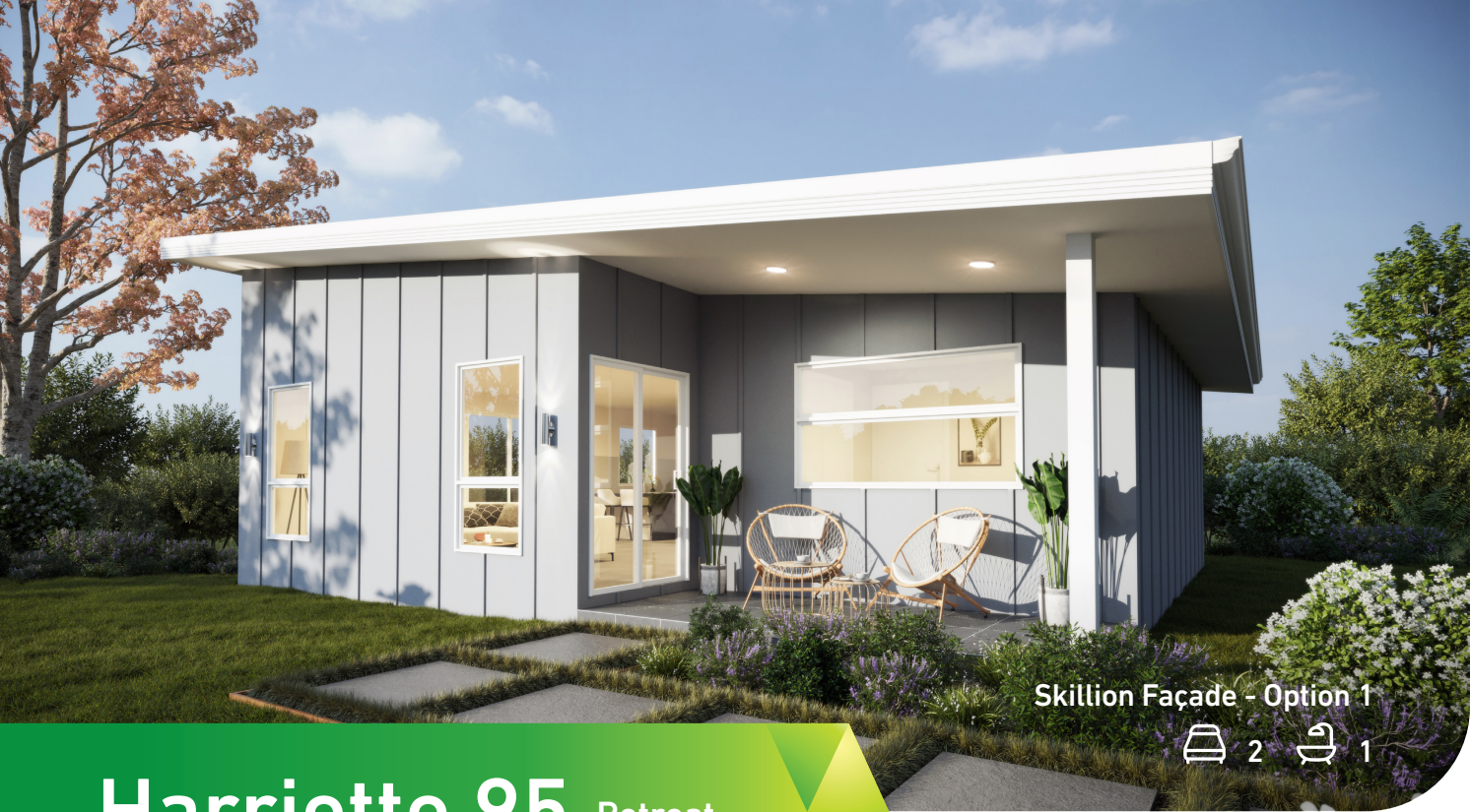
Skillion Façade - Option 1