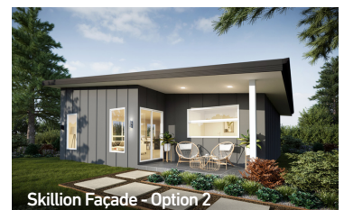
Skillion Façade - Option 2

Floor plan and dimensions shown are for the Classic Façade.