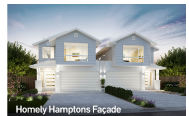
Homely Hamptons Façade