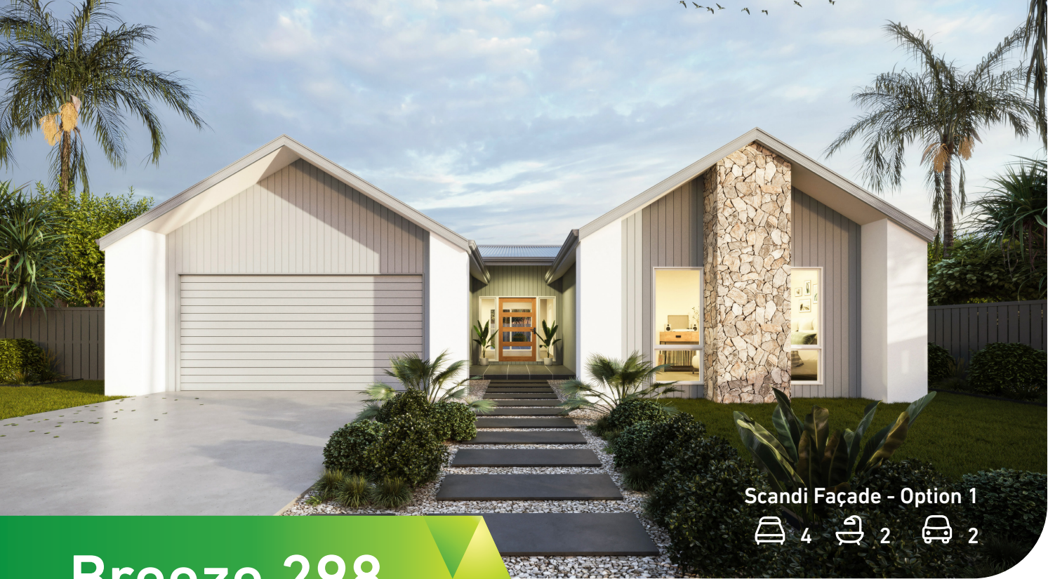
Scandi Façade - Option 1