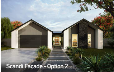
Scandi Façade - Option 2