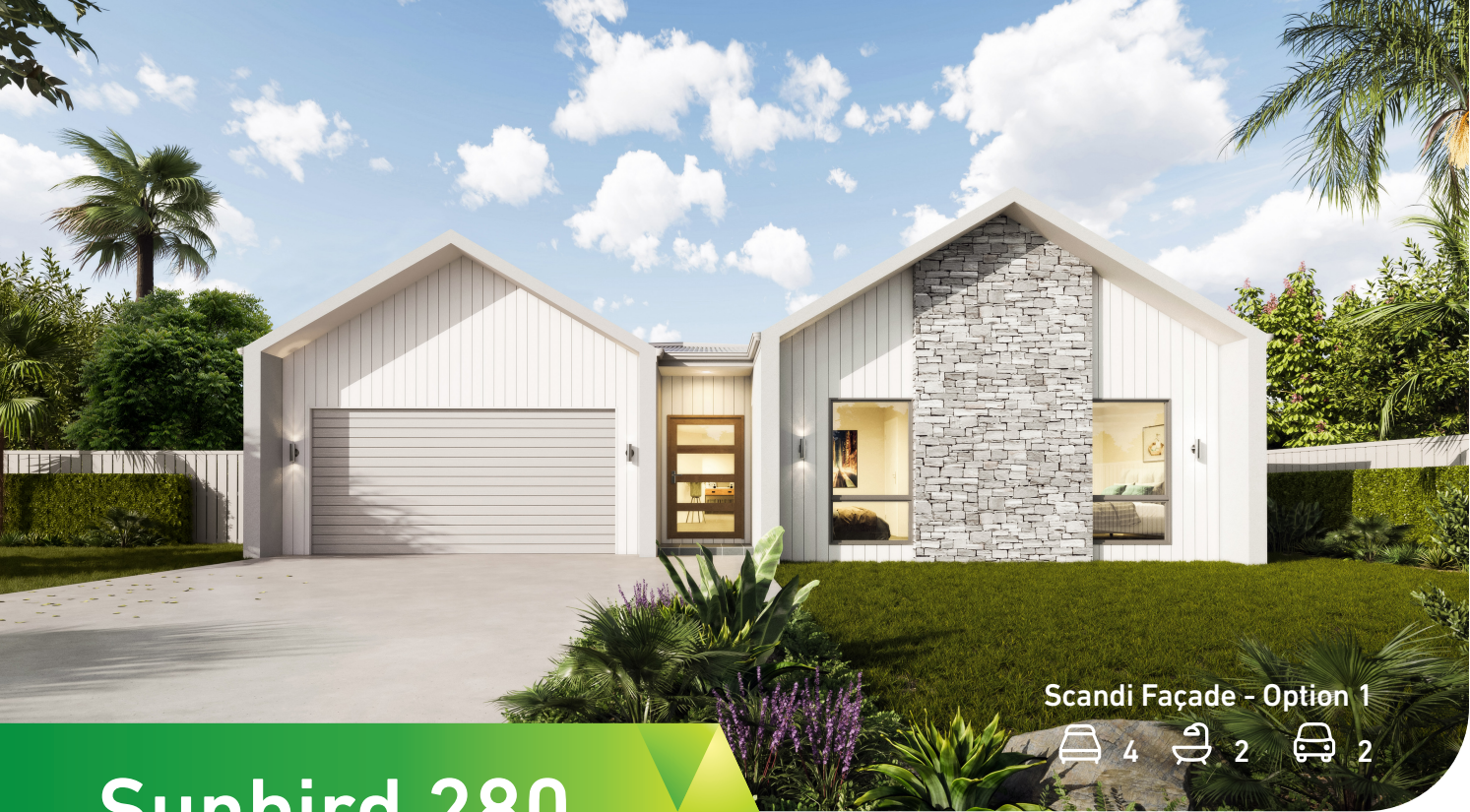
Scandi Façade - Option 1