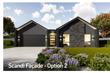
Scandi Façade - Option 2