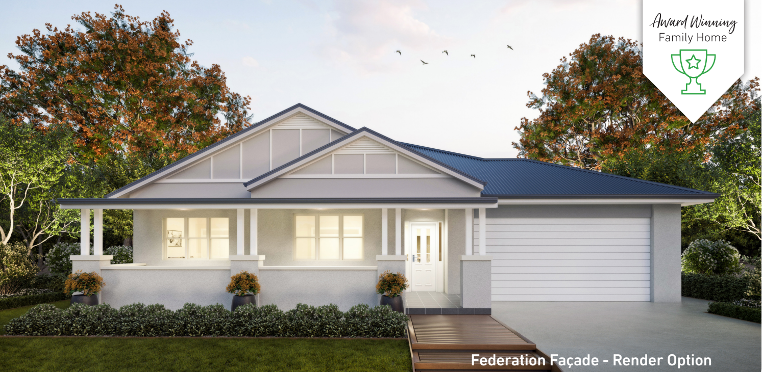
Federation Façade - Render Option