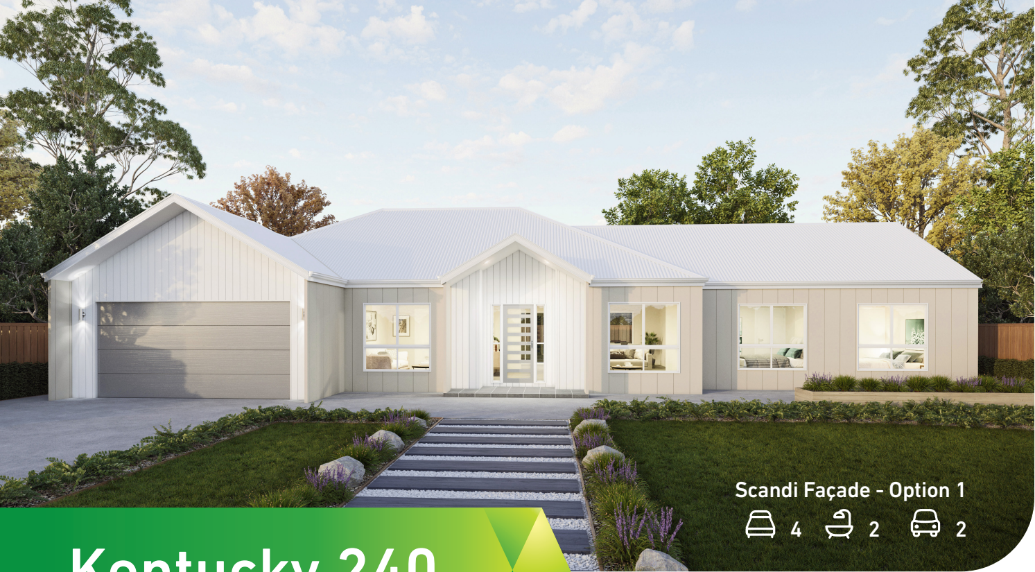
Scandi Façade - Option 1