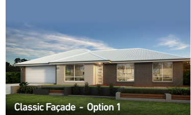
Classic Façade - Option 1