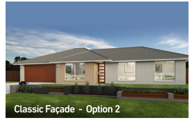
Classic Façade - Option 2