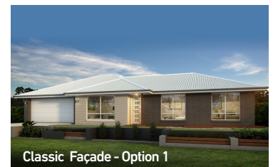
Classic Façade - Option 1