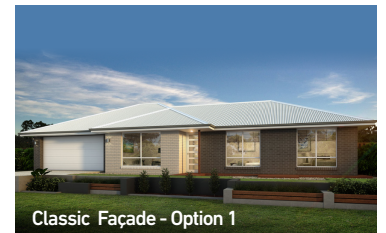
Classic Façade - Option 1