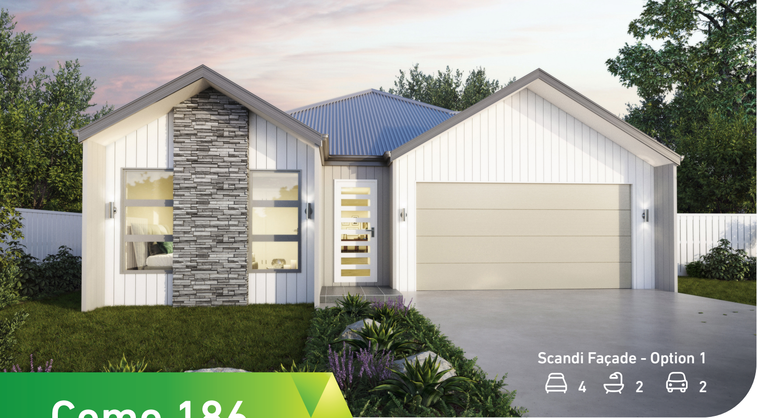
Scandi Façade - Option 1