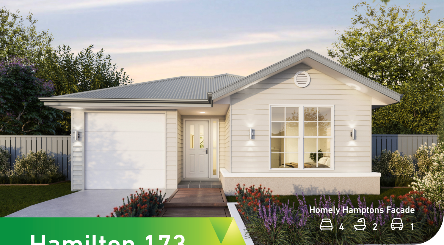
Homely Hamptons Façade