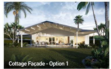
Cottage Façade - Option 1