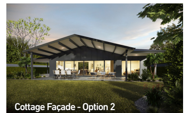
Cottage Façade - Option 2