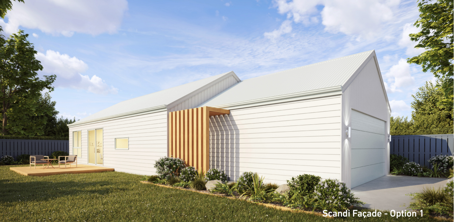
Scandi Façade - Option 1